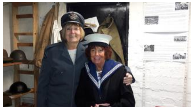
In the Tudor House, Worcester