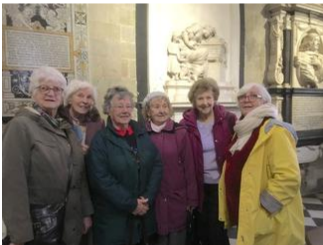
Inside Worcester Cathedral

Many of us also visited the Tudor House – a small museum, with almost no flat surfaces to be seen. The museum documented some of the uses of the building from Tudor times to now – the exhibits included replica military uniforms as you will see from the photograph.