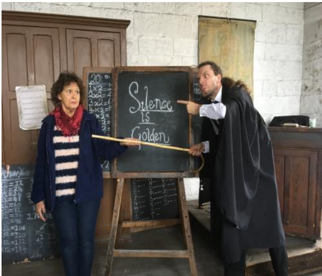
We all enjoy a lesson at the Black Country Museum

The municipal buildings included a pub, a Methodist chapel, and a school. We also took part in a mid-19 th century school lesson.