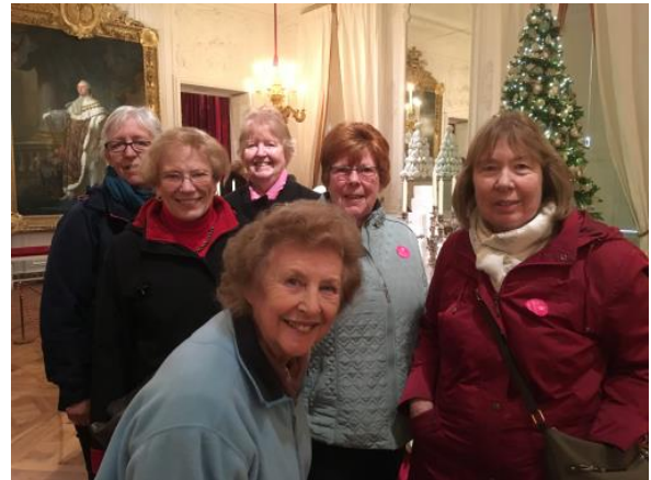
Waddesdon Manor at Christmas

This beautiful French Chateau set in an English landscape was decorated for Christmas.