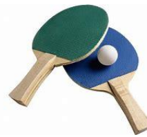
Table Tennis 8 is about to start. This will be on Mondays at 10am starting on 7th January 2019 at Loughborough Leisure Centre, Browns Lane. If anyone is interested please

Click on the Members Area of our website