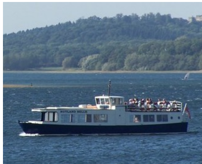
Rutland Belle on Rutland Water

Our first trip, on Saturday 24th July 2021 , will be to Buxton and Bakewell . Pickup time at Nanpantan Sports Ground is 9 am and we leave Bakewell at 4:30 pm. The cost is £12 per person.