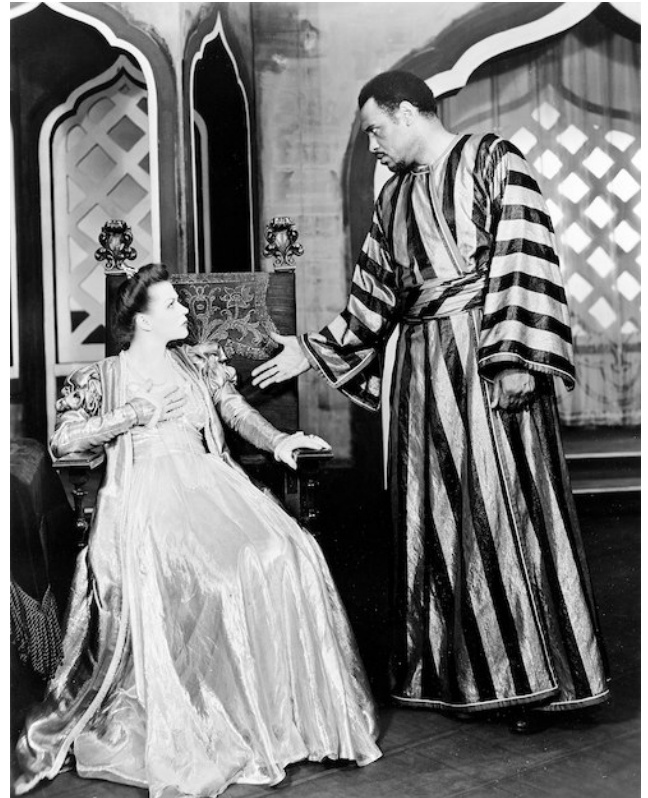
Paul Robeson with Uta Hagen in the Theatre Guild production of Othello (1943-44)

It was a happy release when the whole cast took a curtain call, all well and smiling. It was a memorable performance of Shakespeare, but the magic of that afternoon was the long moment when the great man of the 20th century suspended time and place to express his pleasure at being there.