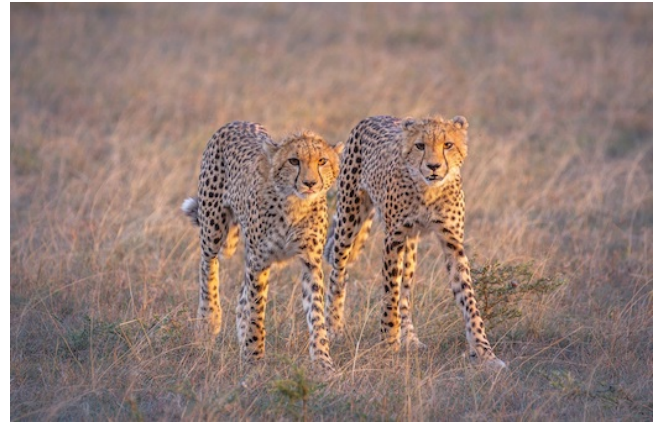
Cheetahs in Africa.

During my time in Africa, I have been running safari camps with my husband. I also spent time working and supporting the local communities, especially with Primary Schools and Health Clinics and purchasing locally grown and made products to support the community. The local communities were so welcoming and friendly, they have very little but always wanting to share and make time for you.