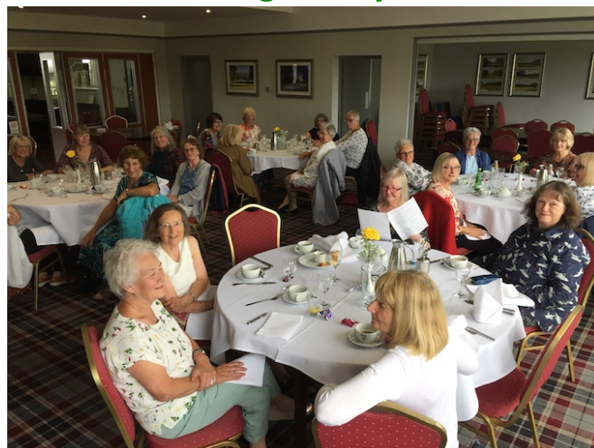
Enjoying lunch at Longcliffe Golf Club, 16th August