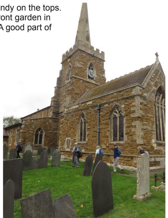
At All Saints Church, Somerby