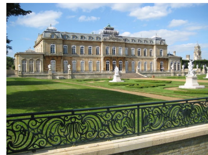
Wrest Park: Wrest House.

In July we are off to Bedfordshire. Firstly we visit Wrest Park ( pictured right ), an English Heritage site, where we will be able to enjoy dazzling parterres and fragrant borders, sweeping countryside views and idyllic woodland walks. The site illustrates 300 years of the evolution of English garden design. You can also see wall paintings in the Archer Pavilion and keep a look out for the rustic bath house and the Chinese bridge.