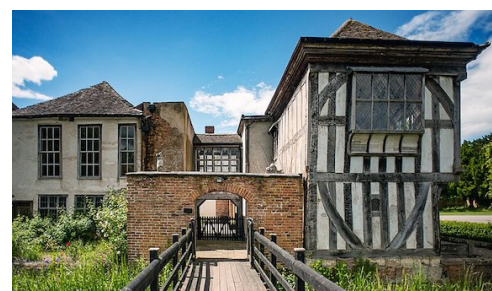
Middleton Hall viewed from moat.

The September trip is to the West Midlands, Cannock Designer outlet centre, followed in the afternoon by a trip to Middleton Hall. The outlet centre has over 60 designer shops and lots of places to eat. In the afternoon we make our way to Middleton Hall ( pictured right ), set in 42 acres of the peaceful North Warwickshire countryside. Journeying through the magnificent manor house, Georgian walled garden and peaceful grounds, we can enjoy over 950 years of remarkable history. With elements of the hall dating back to the 13th Century, discover its rich and colourful past with tales of its inhabitants and their exploits.