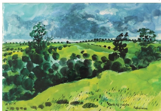
Castle Hill, Hallaton, 2005 by Rigby Graham