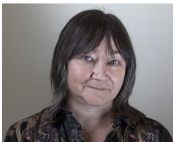
Ali Smith, pictured in The Guardian, 27 Oct 2017.

Dealing with life, love, death and displacement, Hotel World is a sumptuous and deliciously wicked book, a real treat.