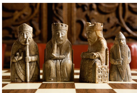
From The Guardian , 3 Aug 2012 Photo: Murdo Macleod

https://www.britishmuseum.org/collection/search?title=The%20Lewis%20Chessmen