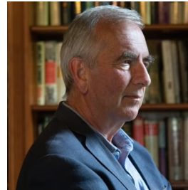
Robert Harris, pictured in The Guardian, 8 Sep 2022.

Robert Harris has written more than a dozen bestselling novels, ranging in subject matter from Cicero's Rome to the impact of the V2 rocket in World War Two.