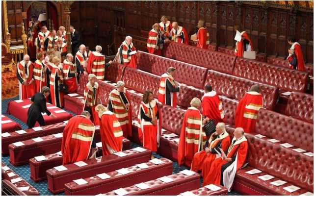
The Telegraph, 6 Aug 2020, Credit: Toby Melville/Reuters

The group also felt that the current House of Lords had far too many members: by a margin of 8 to 1 the group agreed that the number of members should not be greater than one-third of the membership of the House of Commons (meaning no more than 210 members.) Finally, it was unanimously agreed that the members should be subject to term limits.