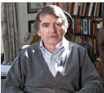
David Lodge died in January 2025, aged 89.

3. Nice Work (1988). Vic Wilcox is an entrepreneur and successful businessman who is persuaded, reluctantly, to become involved with the University of Rummidge's Industry Liaison Programme. Perhaps the funniest book of the Campus Trilogy, Nice Work once again pitches us into the unpredictable world of Swallow, Zapp and colleagues. In 1989 Nice Work was made into a mini-series for TV, starring the excellent Warren Clarke, perfectly cast as Vic Wilcox.