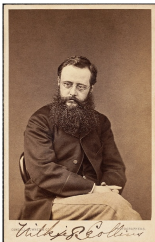
Wilkie Collins photographed in 1864 by Cundall, Downes & Co.

Collins' elegant prose and outstanding character development combine with a gripping plot to make this a highly enjoyable classic of nineteenth century fiction.