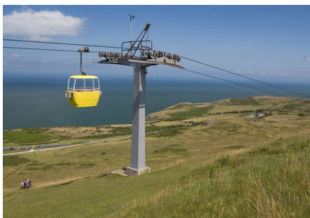
Great Orme cable car, Llandudno

We have spaces available on our July trip to Llandudno. The seaside attractions include the longest pier in Wales, which (besides the view) hosts plenty of opportunities to buy ice-cream and freshly made doughnuts. (Beware of the seagulls!) For most of the length of Llandudno's North Shore there is a wide curving Victorian promenade, with lots of seats. From the prom you can also admire the scenic headlands of the Great and Little Orme. If you are feeling adventurous there is tourist bus or you can make your way up the Great Orme via the wonderful Tramway or even use Britain’s longest cable car – weather permitting. As well as these attractions, the town itself has shops and lots of places to eat. We expect to spend around five and a half hours in Llandudno.