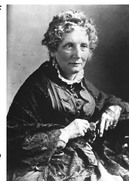
Harriet Beecher Stowe photographed ca. 1870

Although a shocking reminder of the depravity of man, Uncle Tom's Cabin is also a wonderfully evocative, spiritually uplifting book with an ingenious and marvellously rewarding 'double twist' at the end. Enjoy!